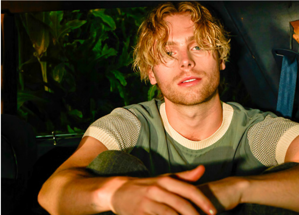
Figure 15: Luke Hemmings from 5sos