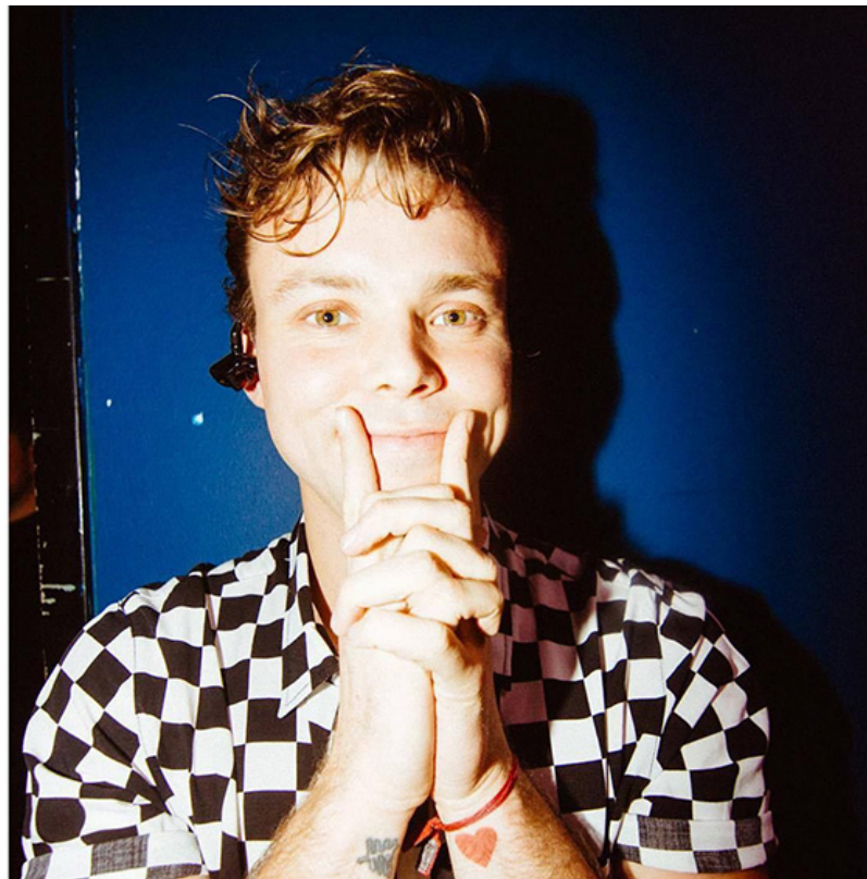
Figure 18: Ashton Irwin from 5sos