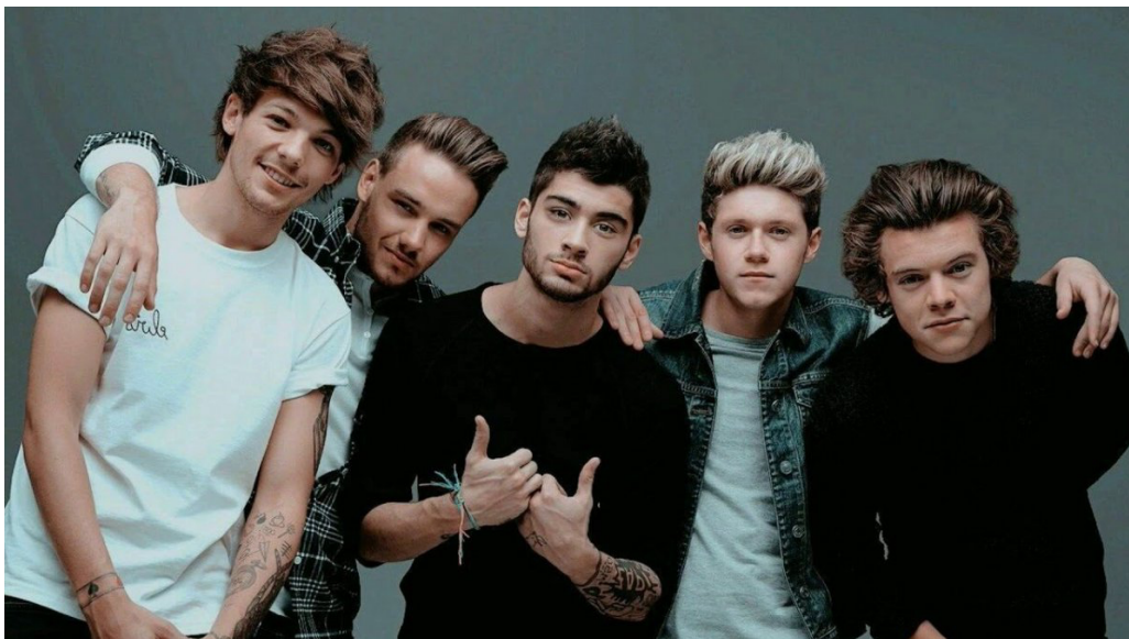
Figure 2: Harry Styles with the band One Direction

While in the band, Styles co-wrote the song "Just a Little Bit of Your Heart" for Ariana Grande's album My Everything (2014).