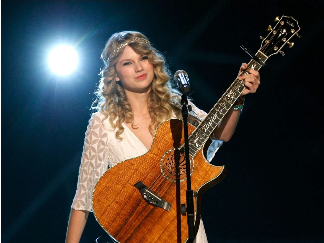
Figure 8: Taylor Swift on stage with her guitar