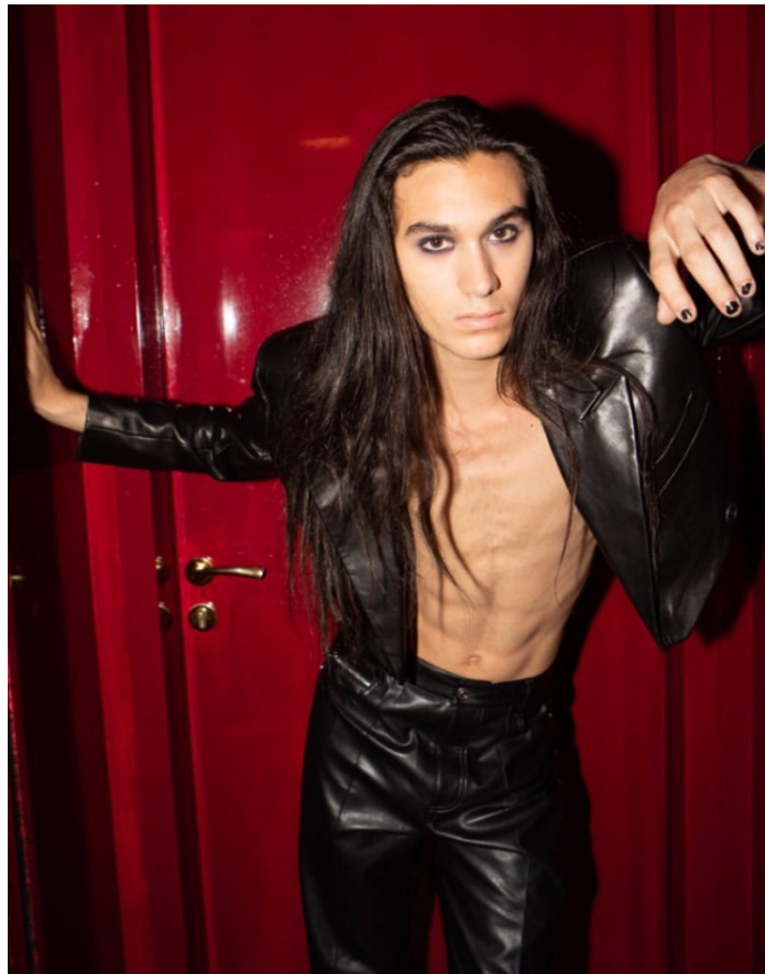
Figure 13: Ethan Torchio from Maneskin