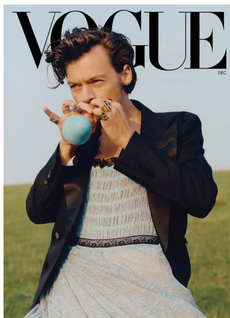
Figure 1: Harry Styles for VOGUE

Throughout his career, Styles has earned several accolades, including two Brit Awards, a Grammy Award, an Ivor Novello Award, and an American Music Award. Aside from music, he is also known for his flamboyant fashion, and is the first man to appear solo on the cover of Vogue magazine.