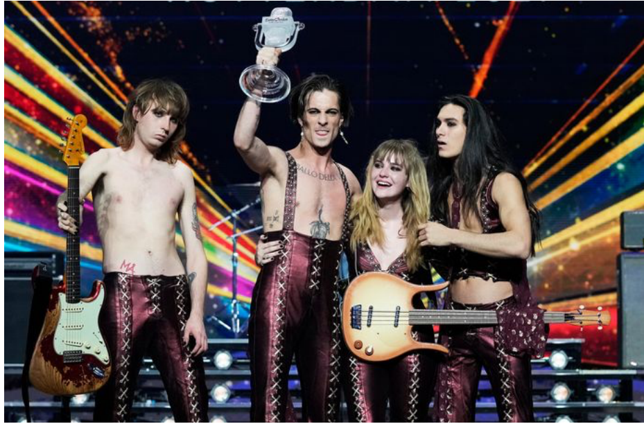
Figure 12: Maneskin at Eurovision