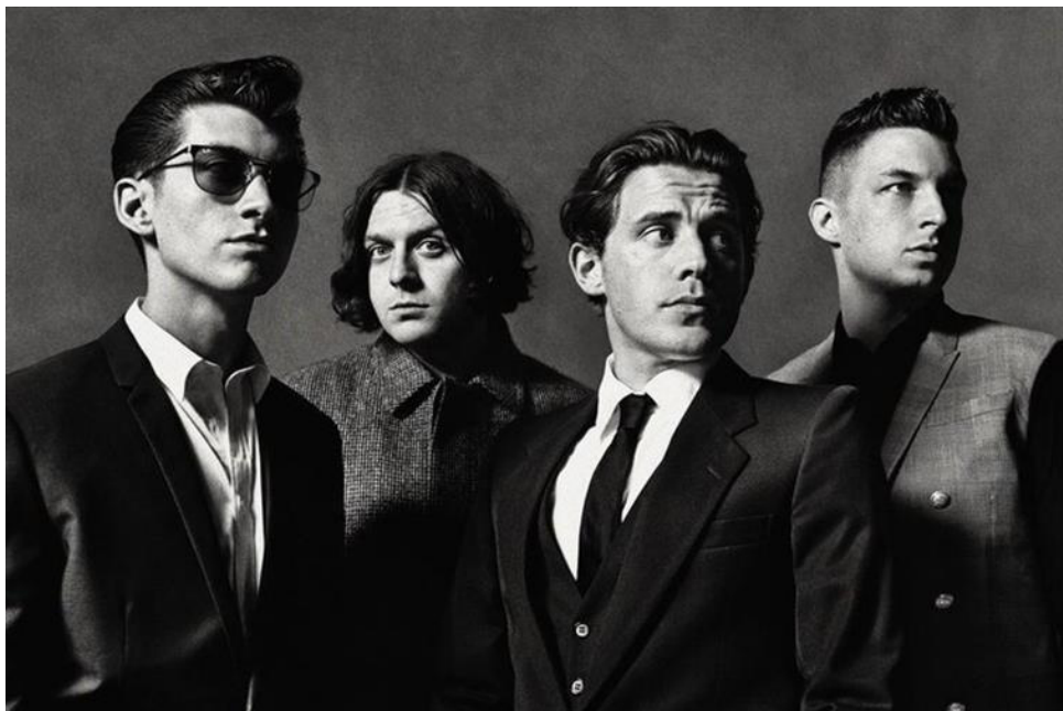
Figure 5: Arctic Monkeys

included in NME's and different editions of Rolling Stone's 500 Greatest Albums of All Time lists.