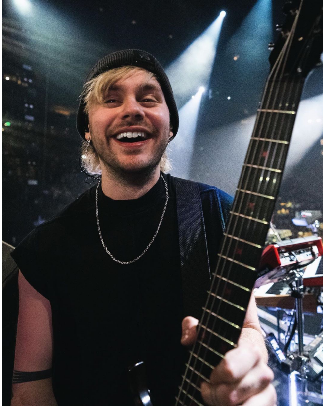
Figure 17: Michael Clifford from 5sos