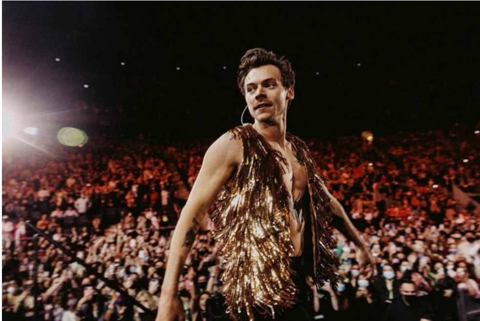
Figure 3: Harry Styles at a Love on Tour concert