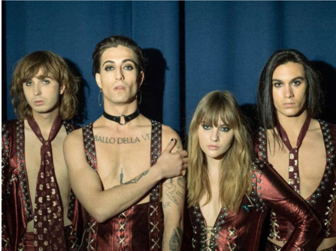
Figure 9: Maneskin

Måneskin became the first Italian rock band to reach the top 10 on the UK Singles Chart, with their songs "Zitti e buoni", "I Wanna Be Your Slave" and their cover of The Four Seasons' "Beggin'" reaching the top 10 on the Billboard Global Excl. U.S. chart, collecting multiple international certifications for sales of over three million copies internationally, and four million in total.