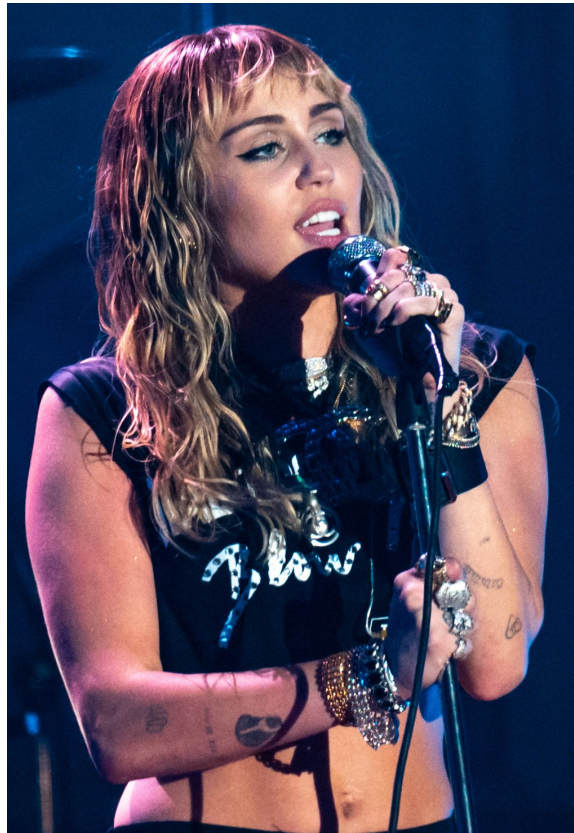
Figure 20: Miley Cyrus

series Black Mirror (2019). Cyrus is an advocate for animal rights and adopted a vegan lifestyle in 2014. She founded the non-profit Happy Hippie Foundation in late 2014, which focuses on youth homelessness and the LGBT community.