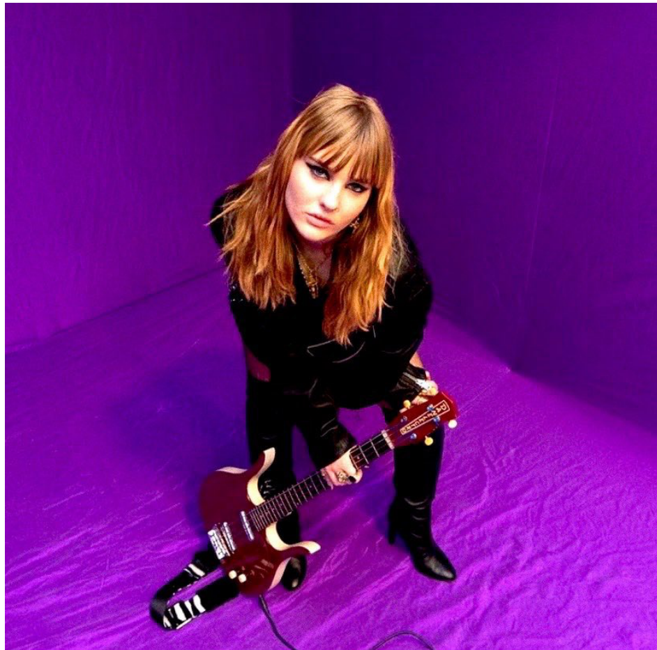
Figure 11: Victoria de Angelis from Maneskin