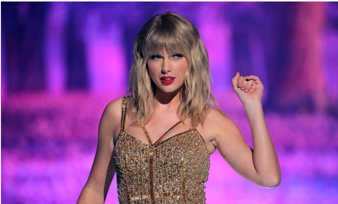
Figure 7: Taylor Swift

Having sold over 200 million records worldwide, Swift is one of the best-selling musicians of all time. Eight of her songs have reached number one on the Billboard Hot 100, and her concert tours are some of the highest grossing in history. She has received 11 Grammy Awards (including three Album of the Year wins), an Emmy Award, 34 American Music Awards (the most for an artist), 25 Billboard Music Awards (the most for a woman) and 56 Guinness World Records, among other accolades. She featured on Rolling Stone's 100 Greatest Songwriters of All Time (2015) and Billboard's Greatest of All Time Artists (2019) lists and rankings such as the Time 100 and Forbes Celebrity 100. Named Woman of the 2010s Decade by Billboard and Artist of the 2010s Decade by the American Music Awards, Swift has been recognized for her influential career and philanthropy, as well as advocacy of artists' rights and women's empowerment in the music industry.