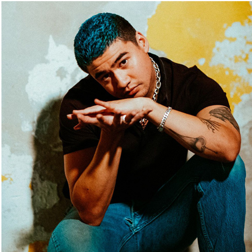
Figure 16: Calum Hood from 5sos