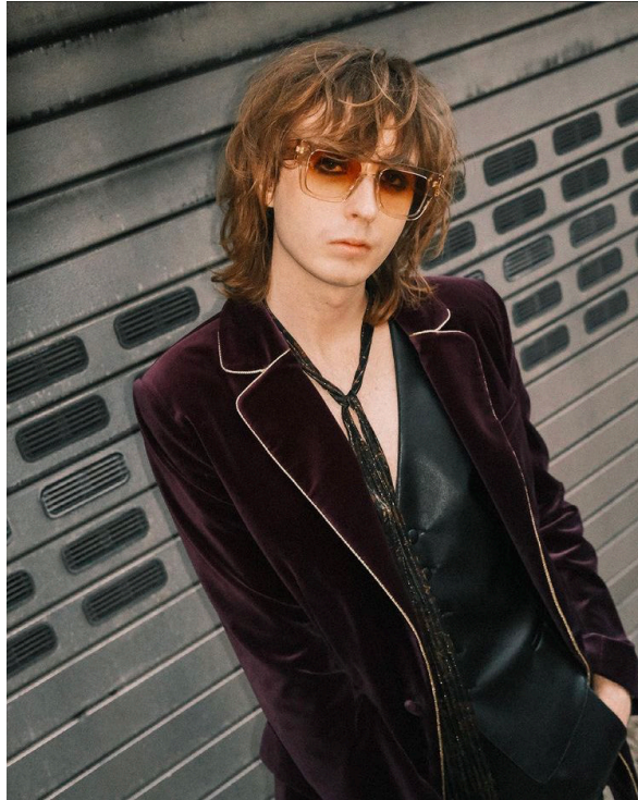
Figure 14: Thomas Raggi from Maneskin