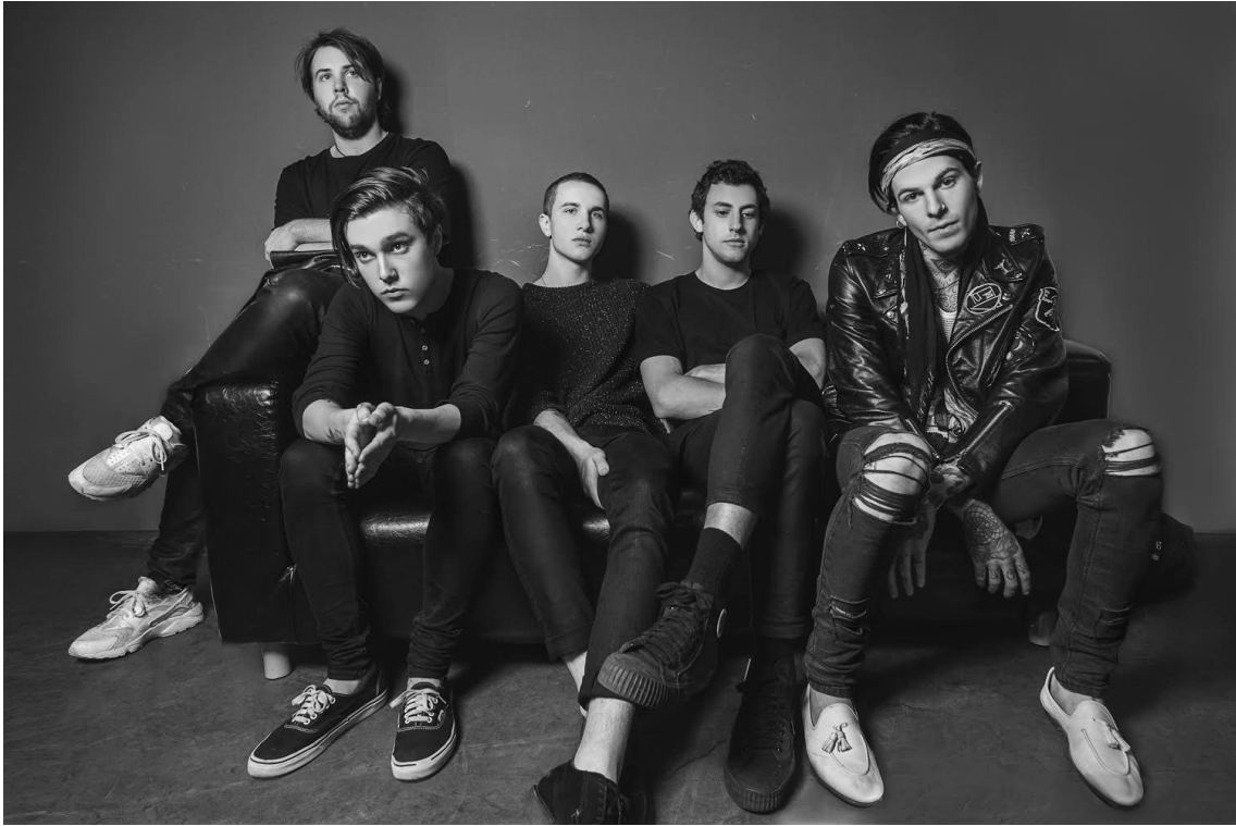
Figure 21: The Neighbourhood

charted on the Billboard 200, and To Imagine on January 12, 2018. After the release of the album, the tracks from the extended plays not included on the final track listing were collected in another EP, Hard to Imagine .