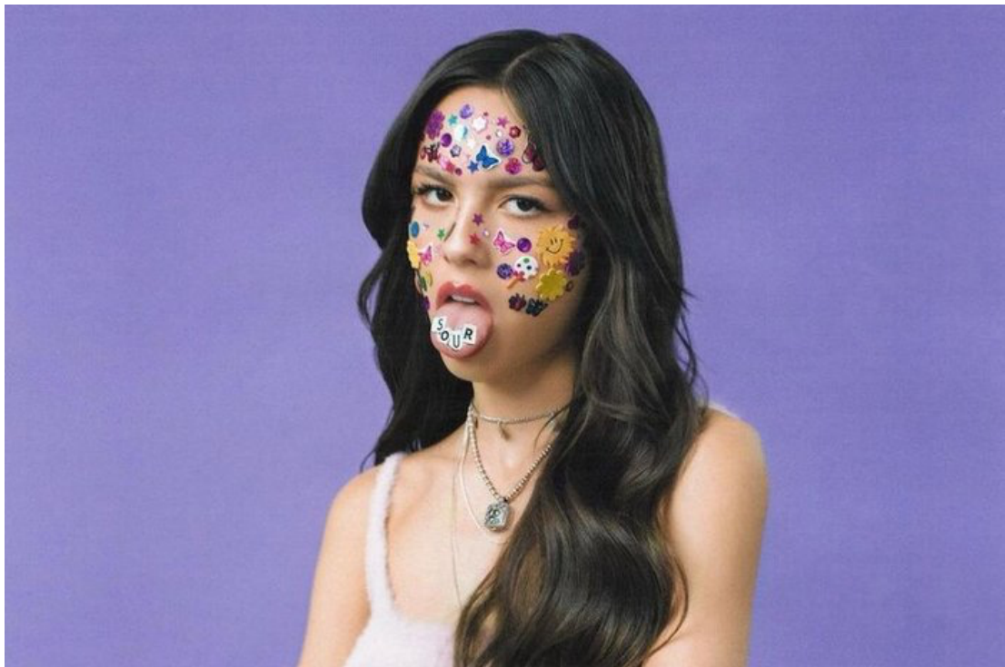
Figure 19: Olivia Rodrigo

Rodrigo's debut studio album, Sour (2021), topped charts globally and was met with widespread critical acclaim. She is nominated in seven categories at the 64th Annual Grammy Awards, including Best New Artist, Album of the Year for Sour , and Record of the Year and Song of the Year for "Drivers License". Time named her the 2021 Entertainer of the Year and Billboard named her Woman of the Year in 2022, making her the first Asian-American artist to be honored.