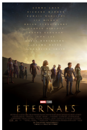
Figure 18 - Eternals (Poster)

Eternals takes place around the same time as The Falcon and the Winter Soldier and Spider-Man: Far From Home (2019), six to eight months after Avengers: Endgame in 2024.[120][121] The mid-credits scene features Harry Styles as Thanos's brother Eros / Starfox and Patton Oswalt as Pip the Troll,[122][123] while Mahershala Ali has an uncredited cameo as the voice of Blade in the post-credits scene, before starring in the film Blade.