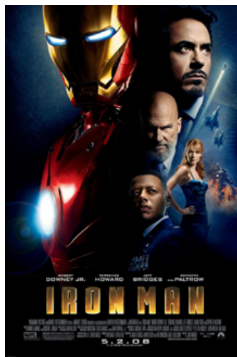
Figure 1 - Iron Man (Poster)

The film ends with a post-credits scene featuring Samuel L. Jackson as Nick Fury, who approaches Stark regarding the "Avenger Initiative". Favreau said that he included the scene as "a little tip of the hat for the fans...a way to sort of tee up The Avengers." Jackson was only on set for a day, with a skeleton crew to avoid the news of his cameo leaking.[41] Captain America's shield is also visible in the background of a scene; it was added by an ILM artist as a joke, and Favreau decided to leave it in the film.