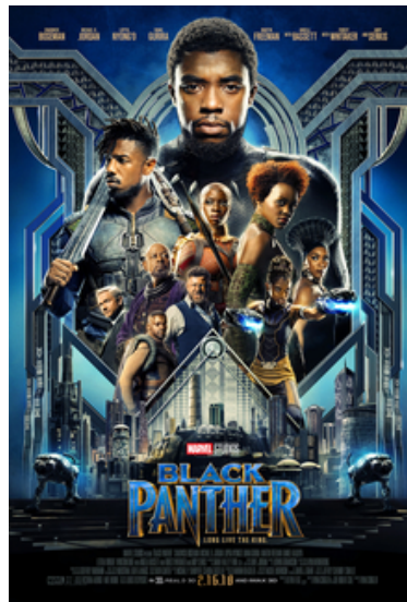
Figure 12 - Black Panther (Poster)

The film is set one week after the events of Captain America: Civil War.[131] Florence Kasumba,[141] Andy Serkis, Martin Freeman, and John Kani reprise their roles as Ayo, Ulysses Klaue, Everett K. Ross and T'Chaka respectively from previous MCU films.[131] The film's post-credits scene features a cameo appearance by Sebastian Stan, reprising his role as Bucky Barnes.[142]