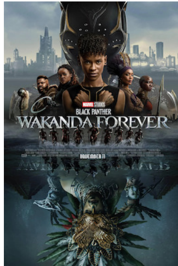
Figure 20 -Black Panther: Wakanda Forever (Poster)