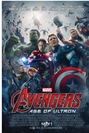
Figure 8 - Avengers: Age of Ultron (Poster)