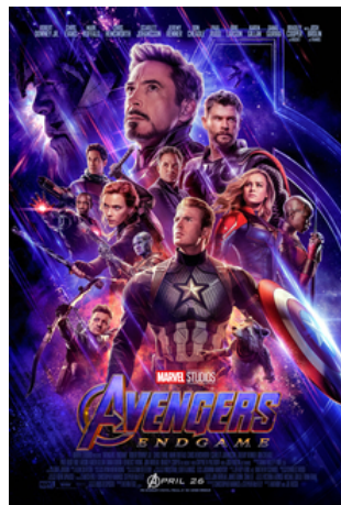
Figure 14 - Avengers: Endgame (Poster)

Avengers: Endgame begins three weeks after the events of Infinity War, before jumping ahead five years.[183] It does not have a post-credits scene, but features the sound of an Iron Man suit being hammered at the end of the credits as a callback to the first MCU film Iron Man,[184] and a teaser trailer for Spider-Man: Far From Home (2019) was played after the credits in some screenings of the film a week after the film released.[185] Endgame was intended to mark the final appearances of Robert Downey Jr. as Tony Stark and Chris Evans as Steve Rogers.[186][187]