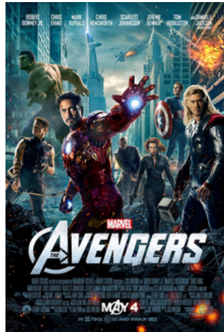
Figure 5 - The Avengers (Poster)

isolation you need for a team."[112] Gregg also returns as Phil Coulson,[113] along with Maximiliano Hernández as Jasper Sitwell from Thor.[114] The supervillain Thanos appears in a mid-credits scene, portrayed by Damion Poitier.