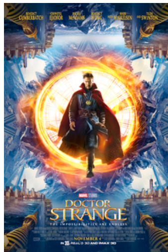
Figure 10 - Doctor Strange (Poster)