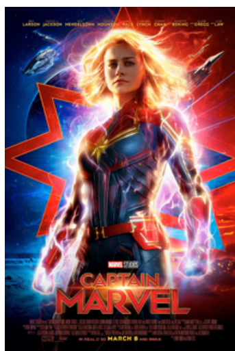
Figure 13 - Captain Marvel (Poster)

The film is set in 1995.[174] Samuel L. Jackson, Djimon Hounsou, Lee Pace, and Clark Gregg reprise their MCU roles as Nick Fury, Korath, Ronan the Accuser, and Phil Coulson, respectively,[175][176] while the Skrull species are introduced to the MCU.[177] The Russo brothers filmed the mid-credits scene, which was footage supposed to occur offscreen before the first scenes of Avengers: Endgame (2019), and features Chris Evans as Steve Rogers, Scarlett Johansson as Natasha Romanoff, Don Cheadle as James Rhodes, and Mark Ruffalo as Bruce Banner. The post-credits scene shows Goose regurgitating the Tesseract on Fury's desk after swallowing it during the film's third act.[178]