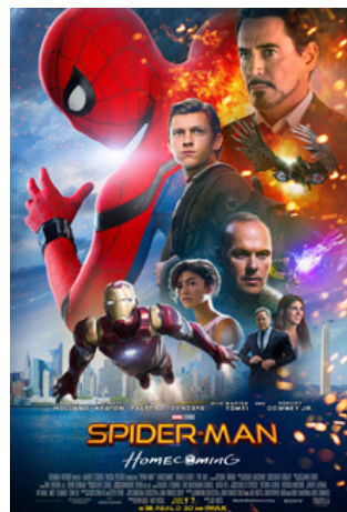
Figure 11 - Spider-Man: Homecoming (Poster)

The film is set several months after the events of Captain America: Civil War,[103] which is four years after the events of The Avengers (2012).[104] In April 2016, Feige confirmed that characters from previous MCU films would appear in the film,[105] with Robert Downey Jr. confirmed to reprise his role as Tony Stark / Iron Man shortly thereafter.[106] Jon Favreau, Gwyneth Paltrow, and Evans also reprise their roles as Happy Hogan,[107] Pepper Potts,[108] and Steve Rogers / Captain America, respectively.[109] The cleanup crew Damage Control appear in the film, after previously being referenced in Iron Man (2008) and the television series Agents of S.H.I.E.L.D., ahead of an intended television series about them.[110][111][112] Various weaponry and artifacts from previous films are referenced throughout the film that Toomes and his crew repurpose for their weapons. In Parker's high school, one of his classes has a lesson about the Sokovia Accords,[113] and portraits of Bruce Banner, Howard Stark, and Abraham Erskine are seen within the school.[114]