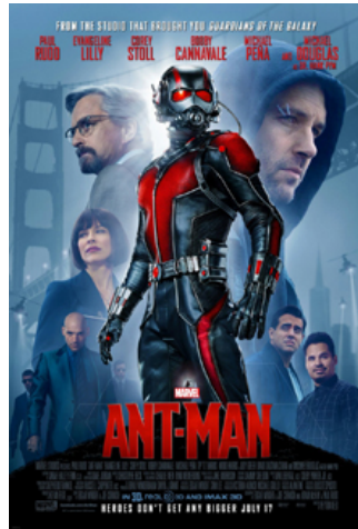
Figure 9 - Ant-Man (Poster)

post-credit scene, which was footage from Captain America: Civil War (2016),[113][114] and features Mackie as Wilson, Chris Evans as Steve Rogers, and Sebastian Stan as Bucky Barnes.