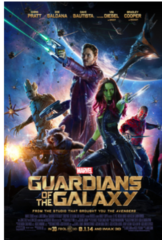
Figure 7 - Guardians of the Galaxy (Poster)