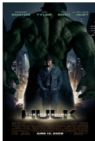
Figure 2 - The Incredible Hulk (Poster)

The film takes place simultaneously with the events of Iron Man 2 and Thor , [52] the former of which is set six months after the events of Iron Man . [53] Downey briefly reprised his role from Iron Man as Tony Stark in a cameo appearance at the end of the film. Downey said that the filmmakers "were just cross-pollinating our superheroes. It happens to be a scene where I basically approach [actor William Hurt's character General Ross], and we may be considering going into some sort of limited partnership together. The great thing is he—and I don't want to give too much away—but he's in disrepair at the time I find him. It was really fun seeing him play this really powerful character who's half in the bag." [54] In addition, Captain America is briefly seen frozen in ice in an alternate opening of the film, included in the DVD release. [55]