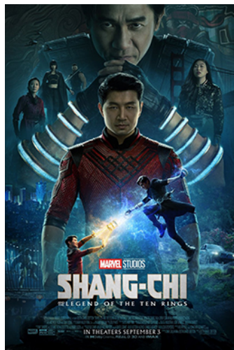
Figure 17 - Shang-Chi and the Legend of the Ten Rings (Poster)

Shang-Chi and the Legend of the Ten Rings is set after the events of Avengers: Endgame (2019),[105] during the days leading to the Qingming Festival in early April.[106] Benedict Wong reprises his role as Wong from previous MCU films,[107] along with Ben Kingsley as Trevor Slattery, an impostor posing as the Mandarin, from Iron Man 3 (2013) and the Marvel One-Shot All Hail the King (2014).[108] The Ten Rings organization has been featured or referenced in Iron Man (2008), Iron Man 2 (2010), All Hail the King, and Ant-Man (2015).[109] Tim Roth also provided uncredited vocals for Emil Blonsky / Abomination, reprising the role from The Incredible Hulk (2008),[107][110] while the mid-credits scene features Mark Ruffalo and Brie Larson, uncredited, in their respective MCU roles of Bruce Banner and Carol Danvers / Captain Marvel.[111]