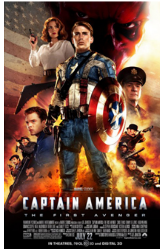
Figure 4 - Captain America: The First Avenger (Poster)

The Tesseract from the Thor post-credits scene appears as a MacGuffin in Captain America: The First Avenger.[99] In the film, Dominic Cooper portrays a young Howard Stark, the father of Tony Stark,[100] who hosts an early version of the Stark Expo, the fair Tony hosts in Iron Man 2.[101] The final scene of the film includes a brief appearance by Jackson's Nick Fury followed by a teaser trailer for Marvel's The Avengers after the credits.[102]