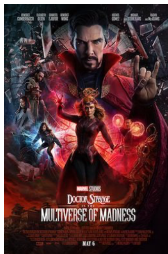
Figure 19 - Doctor Strange in the Multiverse of Madness (Poster)