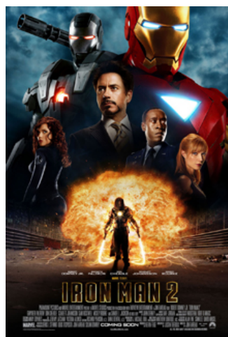
Figure 3 - Iron Man 2 (Poster)

The film is set six months after the events of Iron Man,[53] and takes place simultaneously with the events of The Incredible Hulk and Thor.[52] The filmmakers continued to refer to other Marvel films by again including Captain America's shield. Favreau explained, "We introduced Captain America's shield briefly in one shot in the last film. So now it really was in his room, so we had to figure out how to deal with the reality that the shield was in his workshop." [42] A scene toward the end of Iron Man 2 in a S.H.I.E.L.D. safe house contains several Easter eggs, ranging from footage from The Incredible Hulk displayed on a monitor to pointers on a map indicating several locales related to other Marvel films, including one pointing toward a region of Africa in reference to the Black Panther.[69] A young Peter Parker appears as the child wearing an Iron Man mask whom Stark saves from a drone; the appearance was confirmed in June 2017 by Spider-Man actor Tom Holland, Kevin Feige and Spider-Man: Homecoming director Jon Watts.[70][71] The film's post-credits scene shows the discovery of Thor's hammer in a crater.[72]