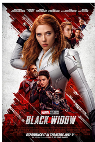
Figure 16 - Black Widow (Poster)

Black Widow is set in 2016, mostly taking place between the main plot of Captain America: Civil War (2016) and its final scene.[91] William Hurt reprises his role as Thaddeus Ross from previous MCU films.[92] Black Widow's post-credits scene features Julia Louis-Dreyfus, uncredited, as Valentina Allegra de Fontaine from the series The Falcon and the Winter Soldier (2021),[41] and sets up Florence Pugh's appearance in the series Hawkeye (2021) as Yelena Belova.[93] Jeremy Renner has an uncredited voice cameo in his MCU role of Clint Barton / Hawkeye, while a picture of him is also featured.[94]