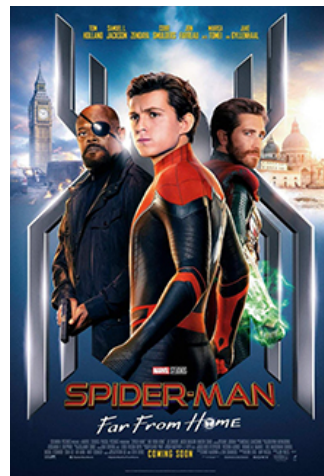
Figure 15 - Spider-Man: Far From Home (Poster)

The film is set eight months after Avengers: Endgame.[200] Jackson and Cobie Smulders reprise their roles as Fury and Maria Hill, respectively, from previous MCU media.[201] The mid-credits scene features J. K. Simmons reprising his role as J. Jonah Jameson, having previously portrayed a different incarnation of the character in Sam Raimi's Spider-Man film trilogy.[202] The post-credits scene features Ben Mendelsohn and Sharon Blynn as the Skrulls Talos and Soren, reprising their roles from Captain Marvel.