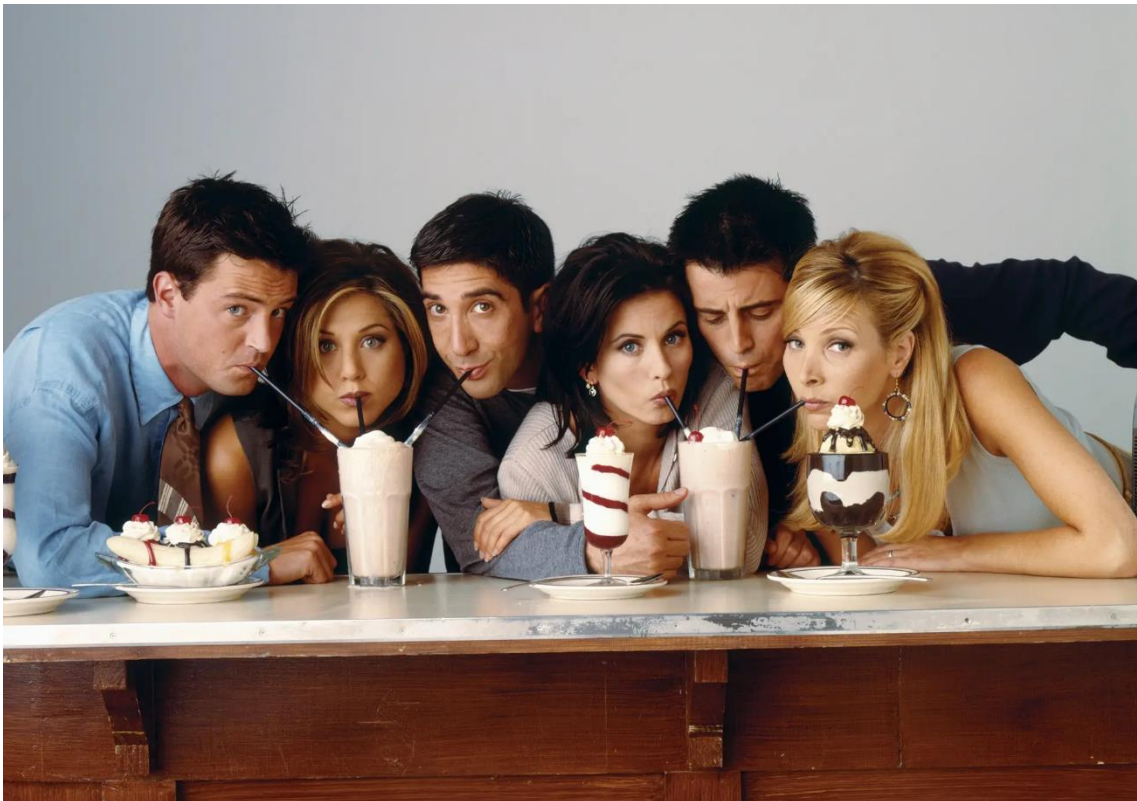
FIGURE 1 FRIENDS DRINKING MILKSHAKES